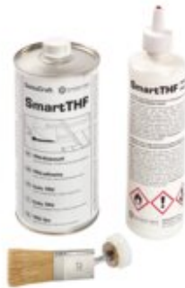
WELD, Flasche + Pinsel