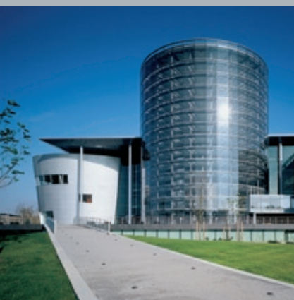
Gläserne Manufaktur building, Dresden

Innovative, customer-oriented solutions developed as a result of decades of experience in the field of roofing and waterproofing membranes.